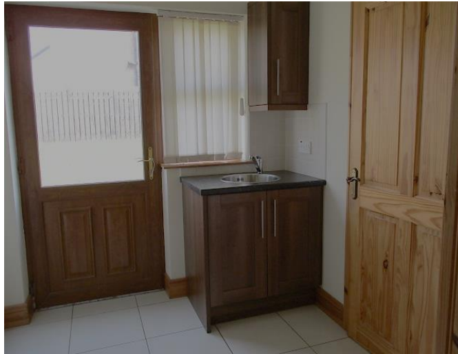
Downstairs Toilet: 7'4 x 3'2 Wash hand basin, toilet, tiled splash back, tiled floor.