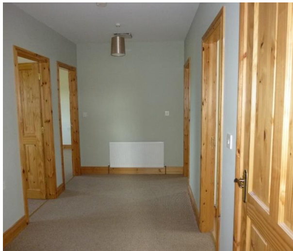
Landing: 14'5 x 3'2 A shelved storage cupboard is off the landing and there is also access to a loft space.